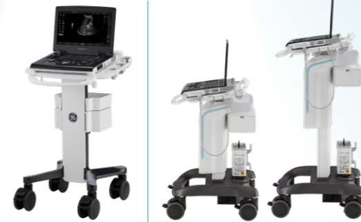
Choice of three optional carts with height adjustability option to suit scanning preferences†