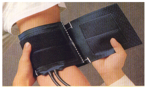
Figure 2. Arrow on cuff aligns with patient's artery, falls within range on cuff.