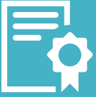
Table of Contents Icon Key:

These courses have been approved for Category A or A+ ASRT approved CE credits. All registered technologists who attend the entire course are eligible to receive CE. Total eligible CE credits are dependent on duration of the course chosen.