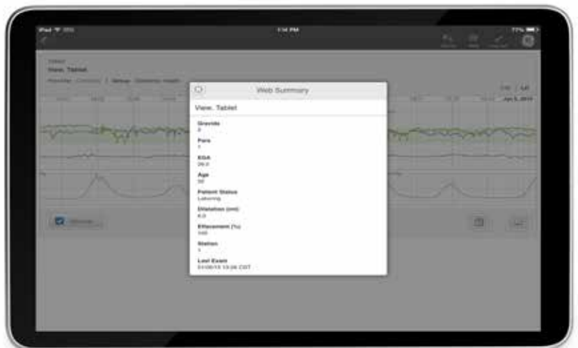
Web Summary showing the latest charted data