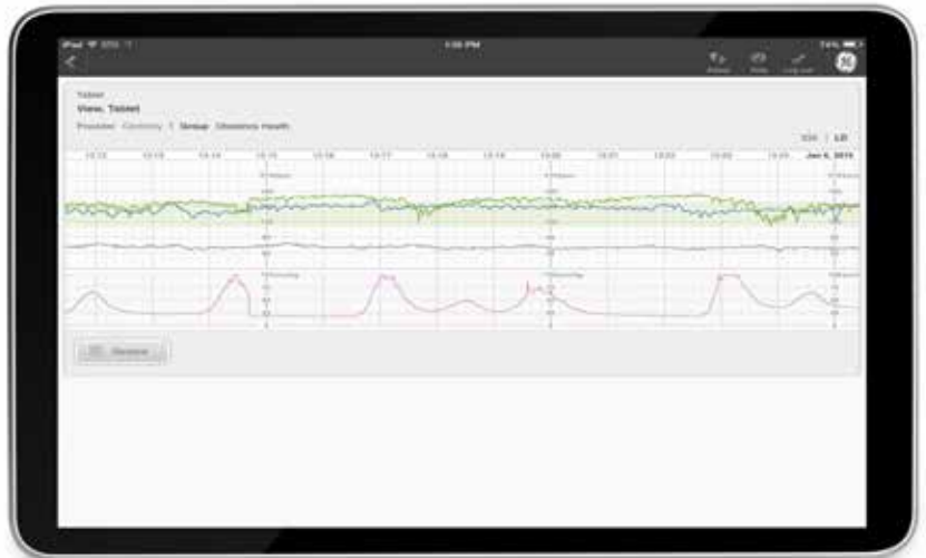
Centricity Perinatal Web Module Streaming View – Physician and Group Display