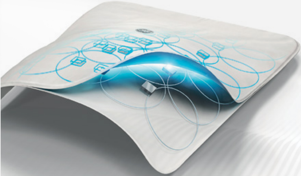
AIR™ Anterior Array Coil (AA)